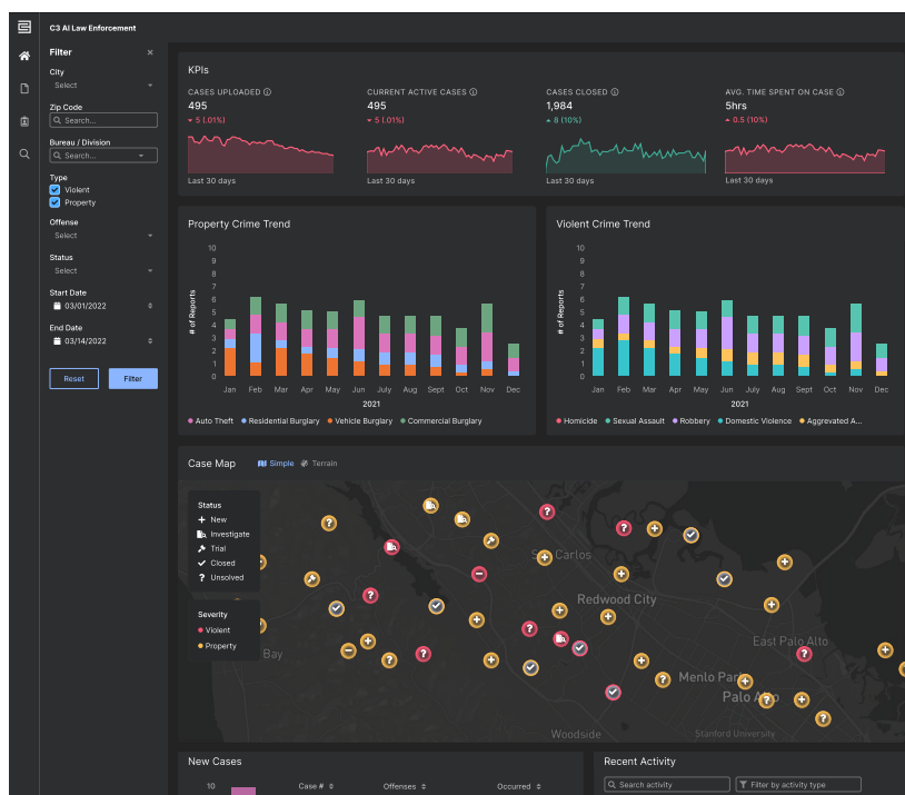
Figure 1. C3 AI Law Enforcement provides a single dashboard for the most critical information.